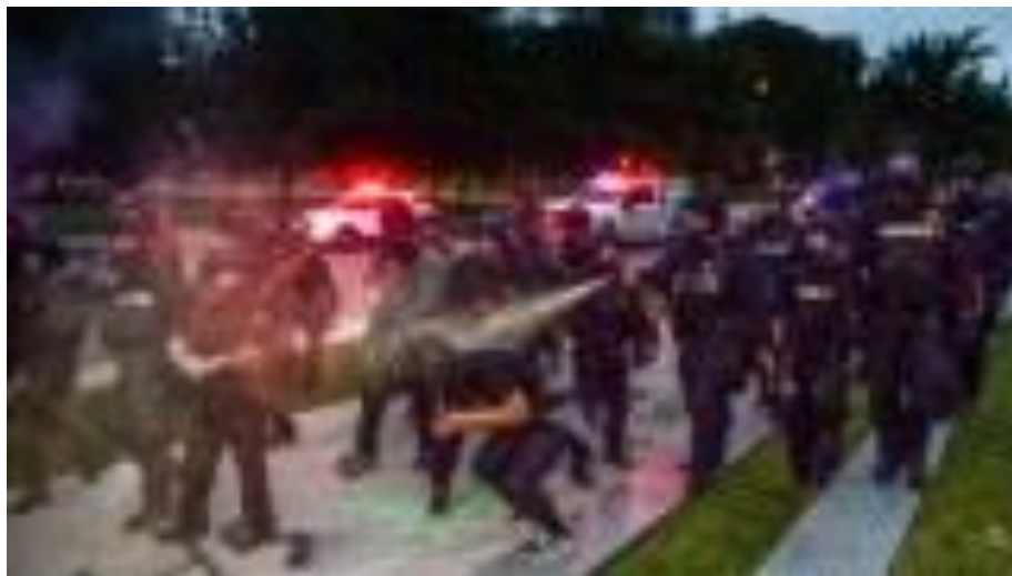
A police officers pepper spray a woman on May 30, 2020 in Denver, Colorado.

"That could mean putting people in the streets."