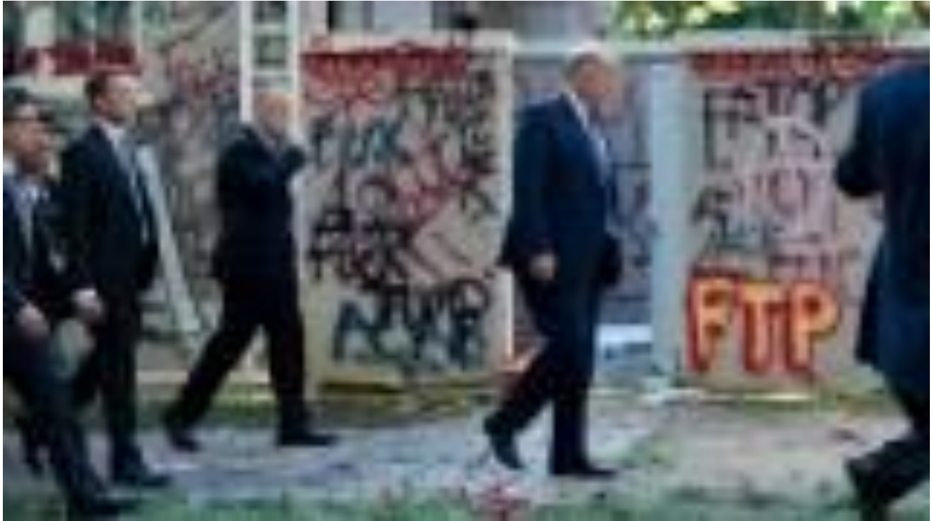
President Trump near the White House on June 1, 2020.

As it turned out, this is exactly what would happen over the following three decades.